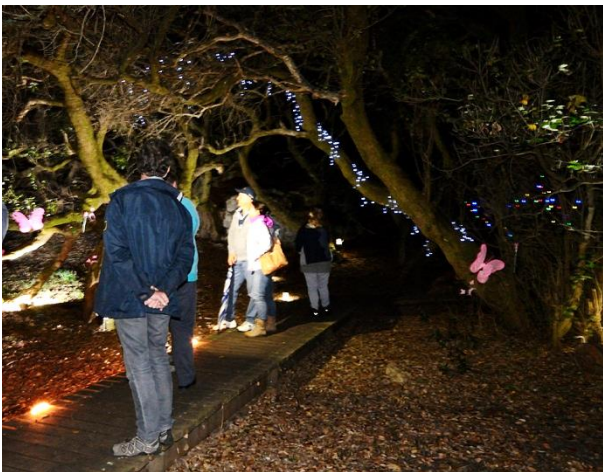
There they were – fabulous forest fairies.

Whale Coast Conservation certainly knows how to make magic.