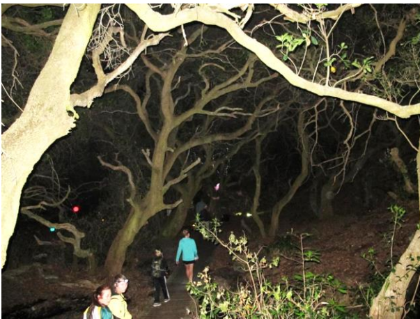
... what was that spotted in the distance?