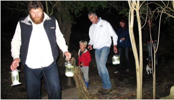
Lanterns lit the way until ...